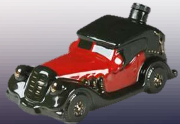
• RETRO CAR •