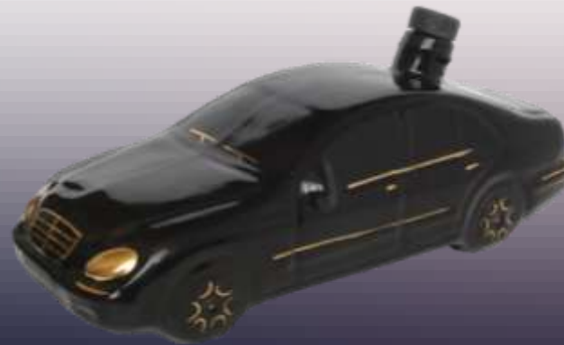
• MERCEDES •