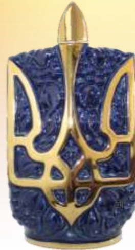
• NATIONAL EMBLEM • 0,75L