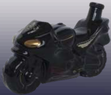
• BIKE •