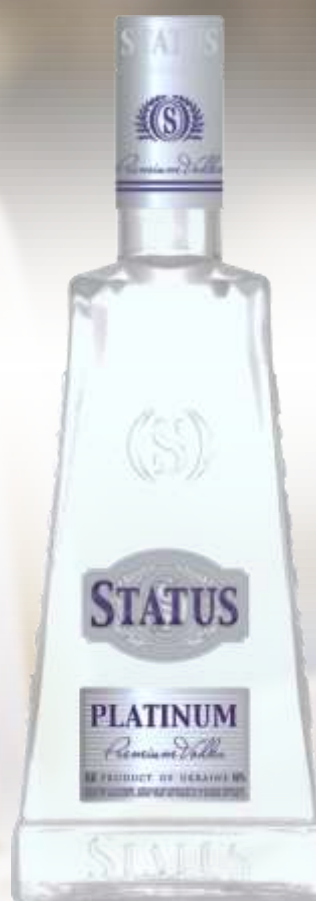
PLATINUM · 40%

Chicory aroma and ideal proportion of components gives exquisite aftertaste