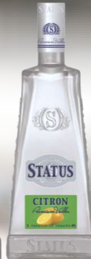
CITRON · 40%