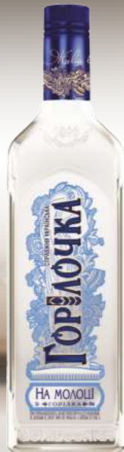
• ON MILK •