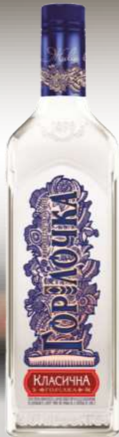
• CLASSIC •