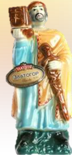
PRINCE • VOLODYMYR • 0,75L