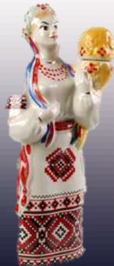
• MARUSYA • 0,7L