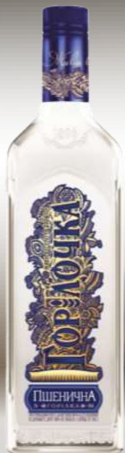
• WHEATEN •