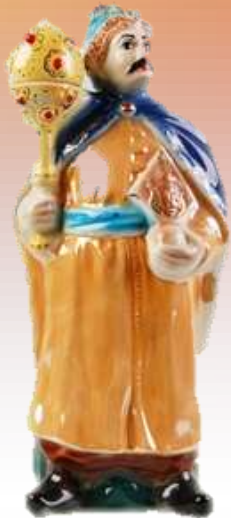
HETMAN • BOGDAN KHMELNITSKY • 0,75L