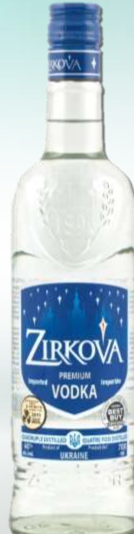
• ZIRKOVA VODKA • 0,7L