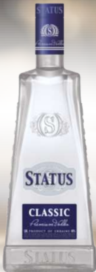
CLASSIC · 40%

White vodka with pure grain taste is authentic representative of classic vodka