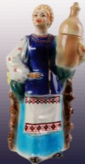
• LARISA • 1,0L