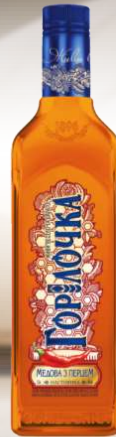
• HONEY & PEPPER •