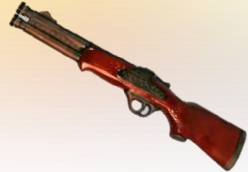
• RIFLE •