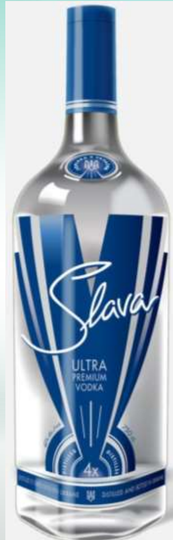
• SLAVA-V VODKA • 0,75L