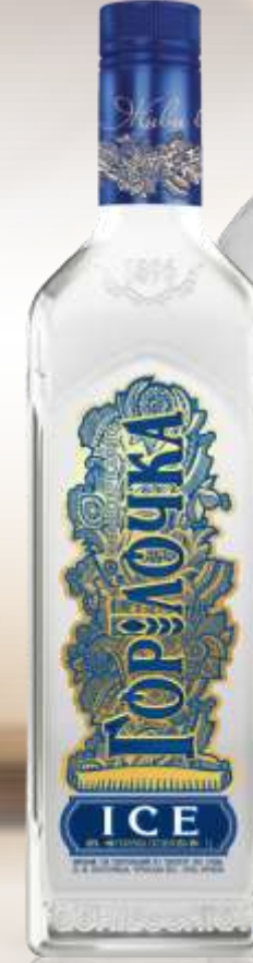
• ICE •