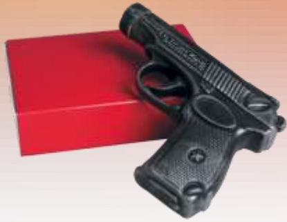
• GUN •