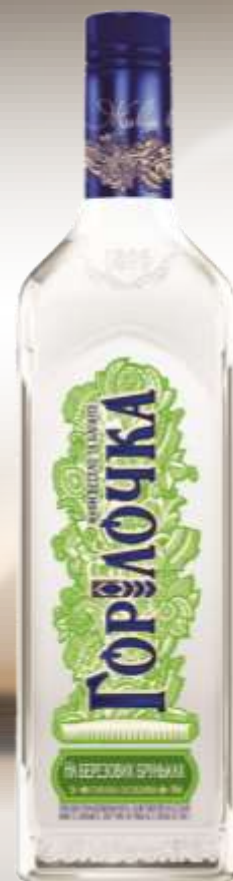
• ON BIRCH BUDS •