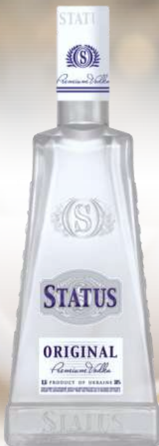
ORIGINAL · 38%

Proficiently composed set of natural honey and aroma spirit of ginseng gives inimitable soft taste and slight elegant aftertaste